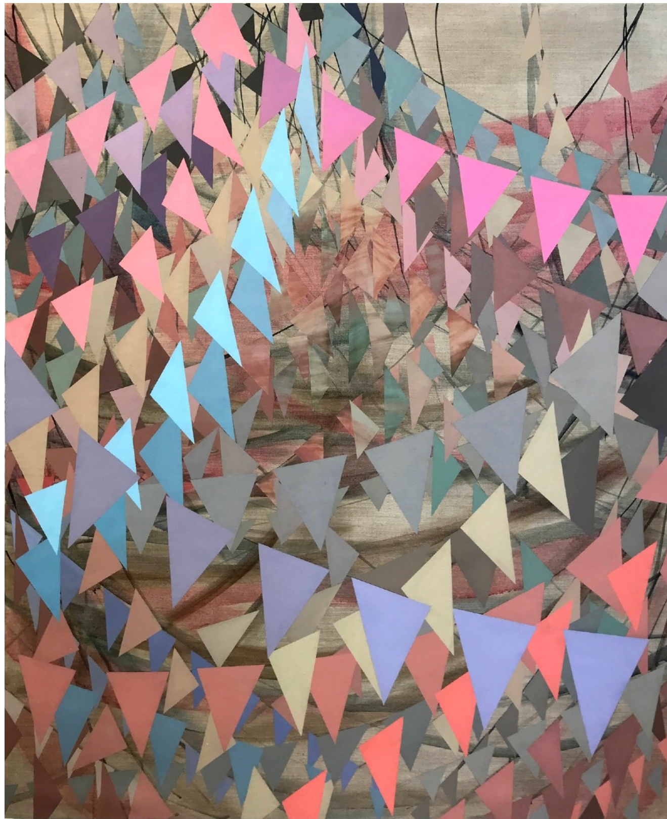
Red Mountains 2021 170 x 140 cm Oil and Acrylics on Linen