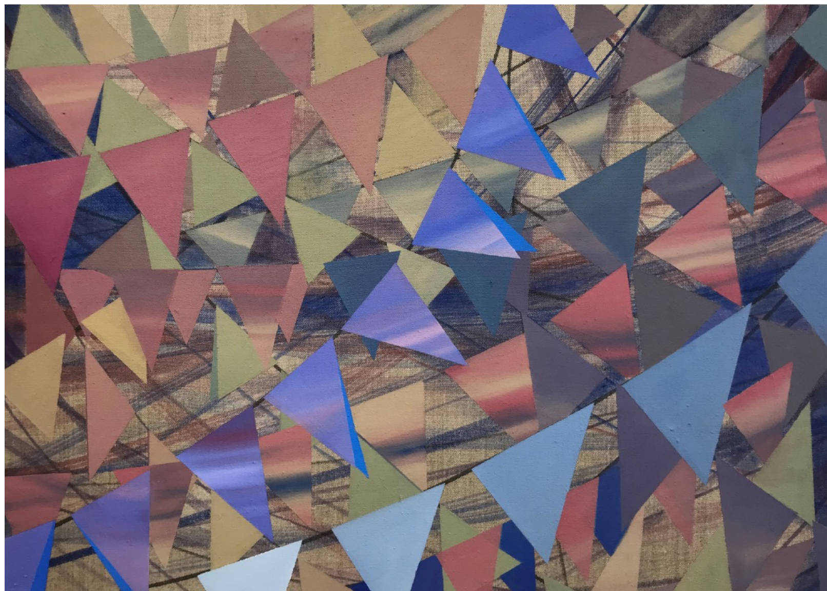
Breeze 2021 50 x 70 cm Oil and Acrylics on Linen