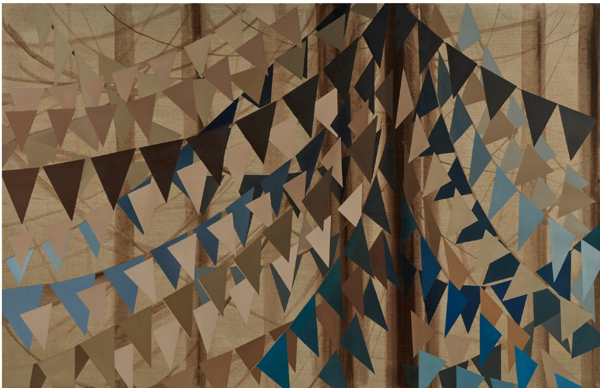
Black Hole 2020 90 x 140 cm Oil and Acrylics on Linen