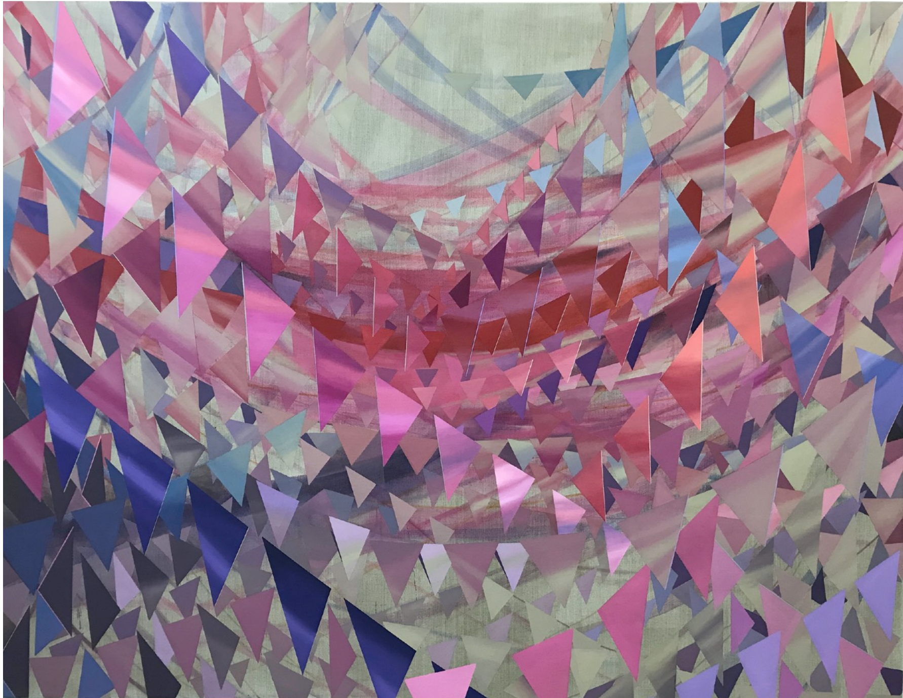
Sunset Boulevard 2022 170 x 220 cm Oil and Acrylics on Linen