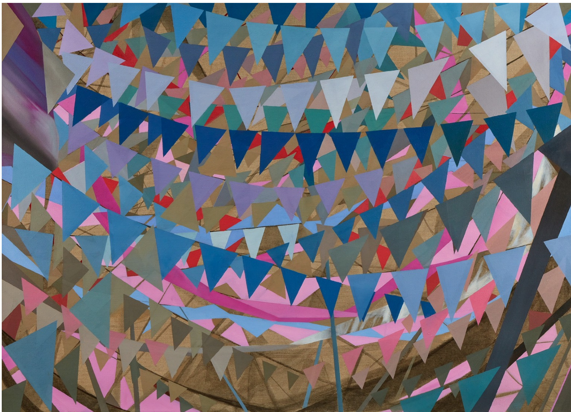
Looking for the Horizon 2021 100 x 140 cm Oil and Acrylics on Linen